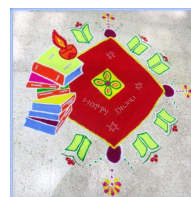
Rangoli

This issue has been compiled by the Institute for Plasma Research (IPR) Library, Gandhinagar