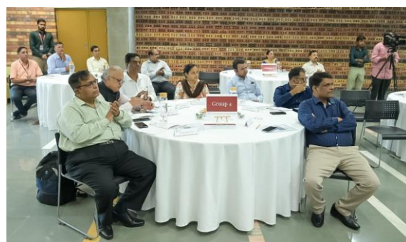
Session 3 - Mind-mapping and group brainstorming to collate the ideas of collaboration and networking with Leaders," the second session, "Dimensions of Library Collaboration and Networking: A Panel Discussion" and third was a mind-mapping session and group brainstorming session to collate the ideas of collaboration and networking.

There were a total of 20 participants from the prominent Institutes within Ahmedabad and few were from outside Ahmedabad.