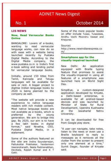
1 st Issue of e-News Digest Published Oct 2014

Let us continue to Collaborate for Creating an Informed Society.