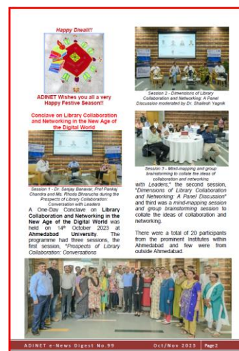
99 th Issue of e-News Digest Published Nov 2023

Evolution of ADINET e-News Digest from 1 st to 99 th Issue