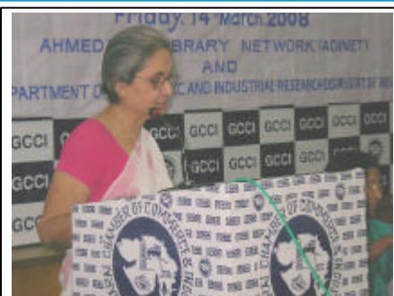
Director addressing DSIR Programme