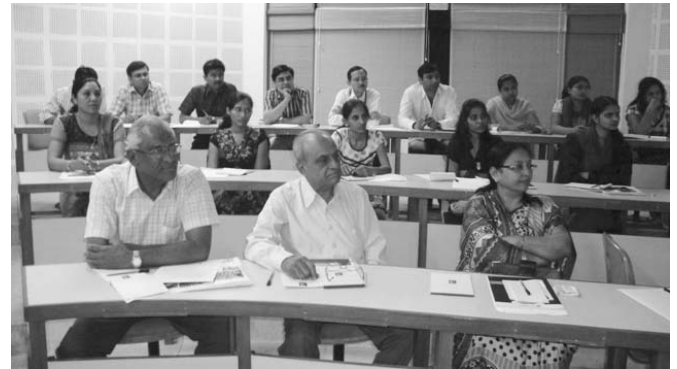
Participants at the MICA Seminar